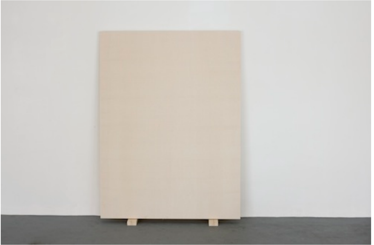
Leaning Canvas , 2010 Handwoven canvas, wood 72 X 54 inches Courtesy of the Artist and David Castillo Gallery